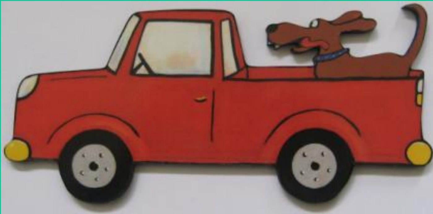
The original (and much loved) Woofa from 2009 This edition updated for the next generation in 2021 www.enticott.com.au